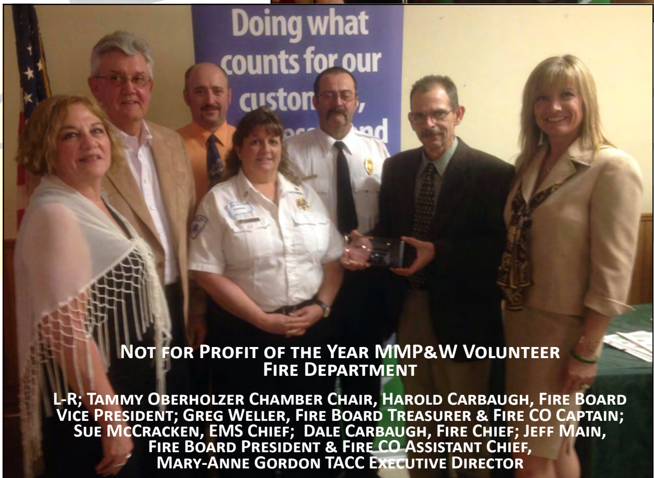
NOT FOR PROFIT OF THE YEAR MMP&W VOLUNTEER FIRE DEPARTMENT