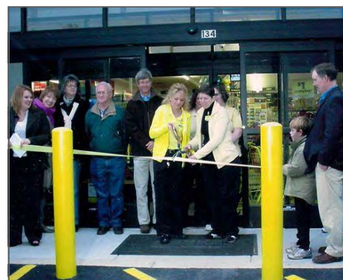
The Dollar General opens in Fort Loudon, PA.