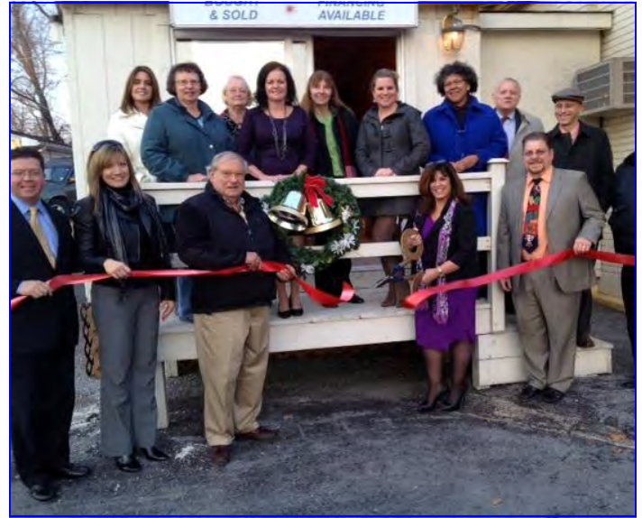
Main Street Insurance 307 North Main Street, Mercersburg