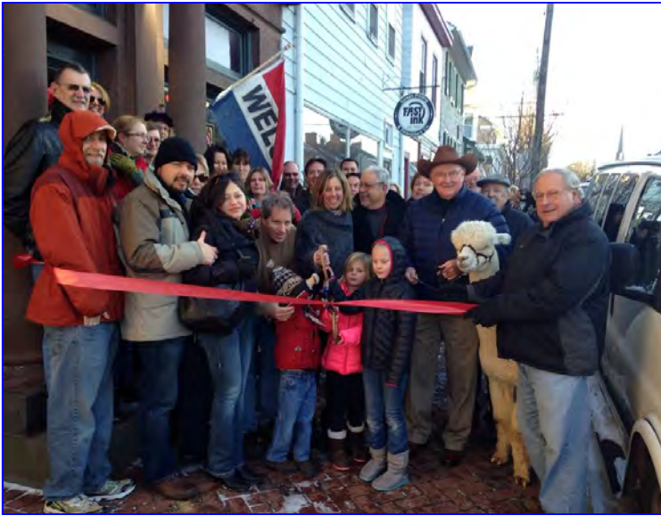
Pachallina Alpaca Clothing, Luxury Fibers and Home Décor 13 South Main Street, Mercersburg