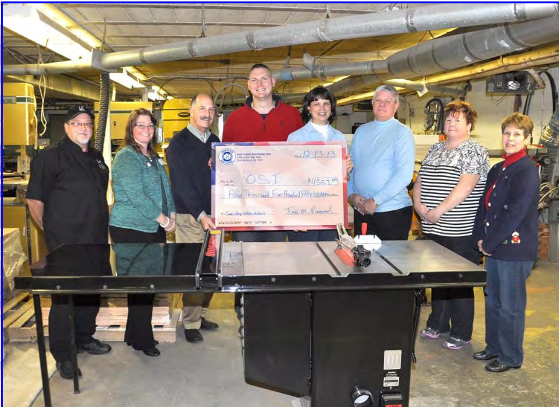
The staff and board of OSI ~ Occupational Services Inc of Chambersburg thanks the St. Thomas Ruritan Club for donating funds for a Saw Stop Table Saw. This machine will make OSI's operation more efficient and safe.