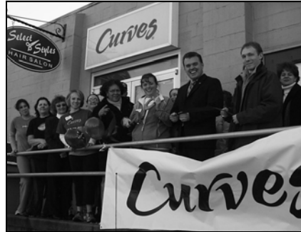
Curves of Mercersburg