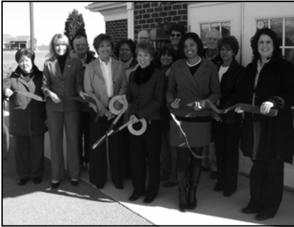
O'Donnell & Associates Tax Preparation & Bookkeeping, LLC