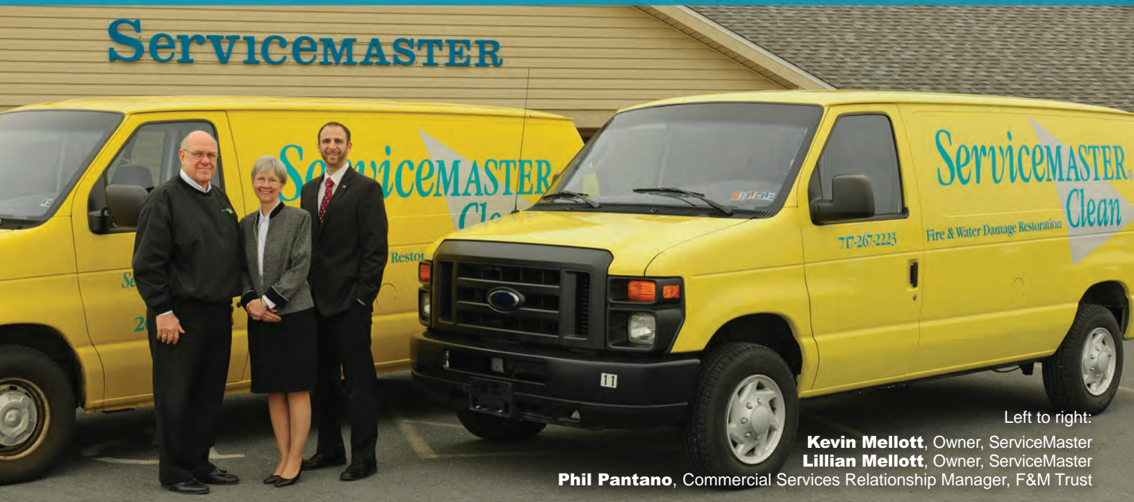
Left to right:

65 employees, 27 busy vehicles, two franchises, and one local bank.