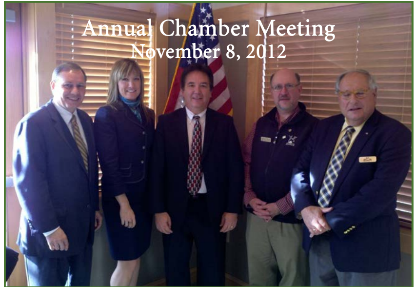
Annual Chamber Meeting November 8, 2012

The wreath decorating is open to TACC members only, your business or church should be located in the Mercersburg region. Not for profits, local and state officials who serve Mercersburg but may not have an office here are also encouraged to participate.